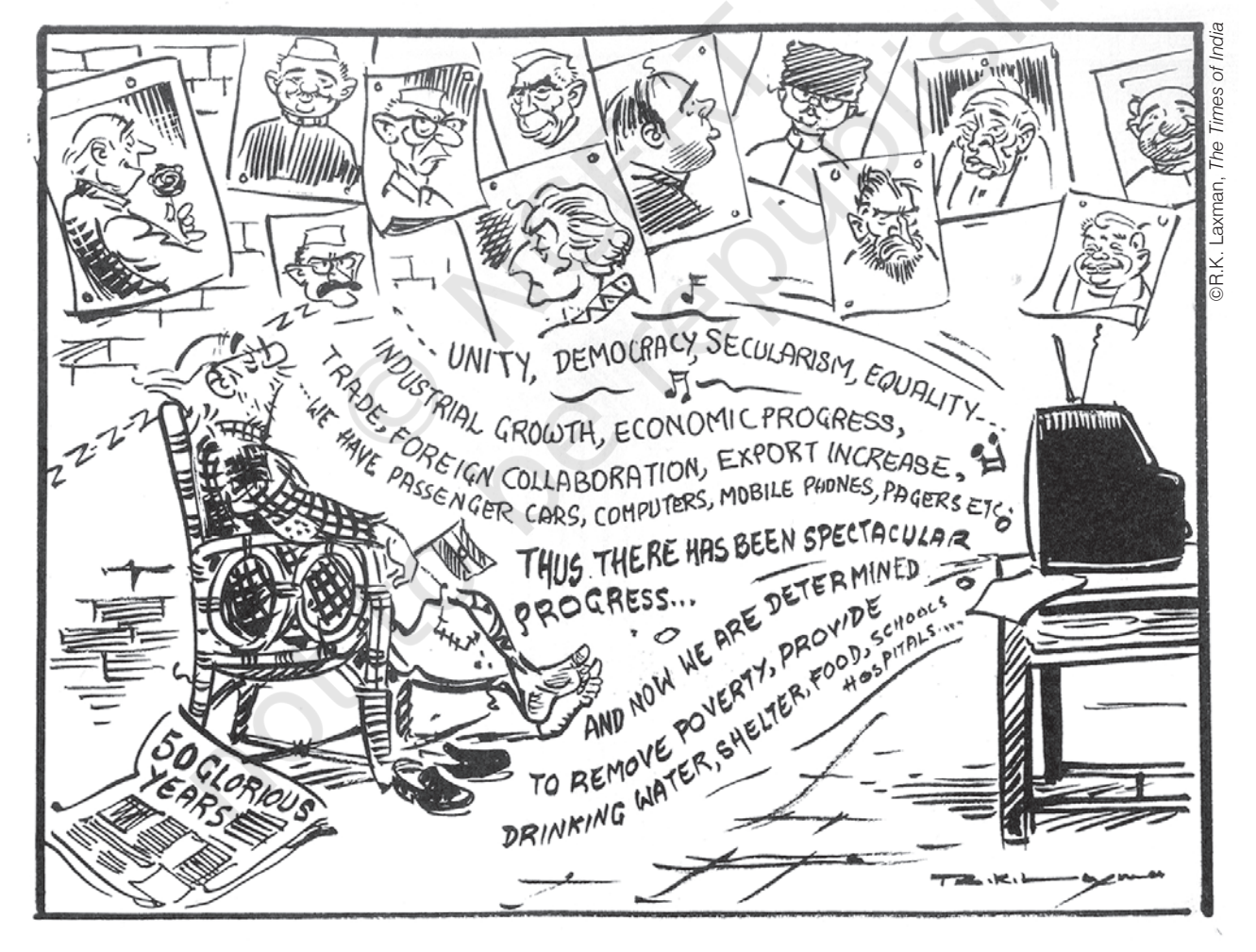
WHAT IS DEMOCRACY? WHY DEMOCRACY?